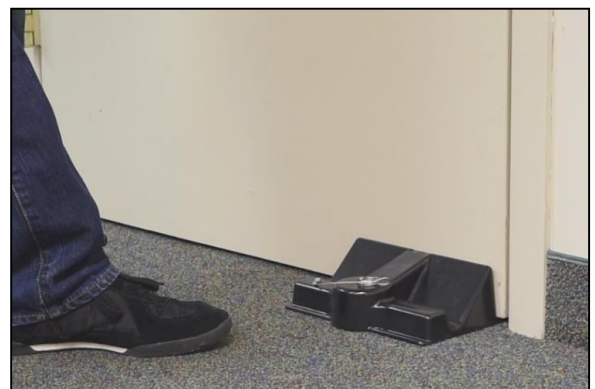
Fig. 3 – Finished Preparation with device deployed

Questions? Email info@doorbearacade.com or call toll-free 855-350-2321