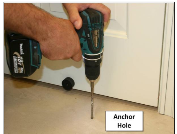
Fig. 5 – Hammer Drill at least 3\frac{1}{2} " deep