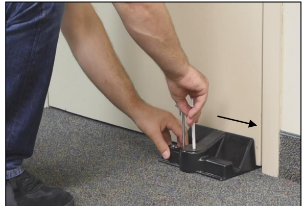
Fig. 1 – Using device to mark Floor Anchor Hole™