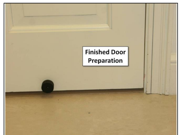
Fig. 6 – Finished Preparation – Alignment Stopper™

It is important to hang or store the device adjacent to the door and consistently throughout your facility from room to room.