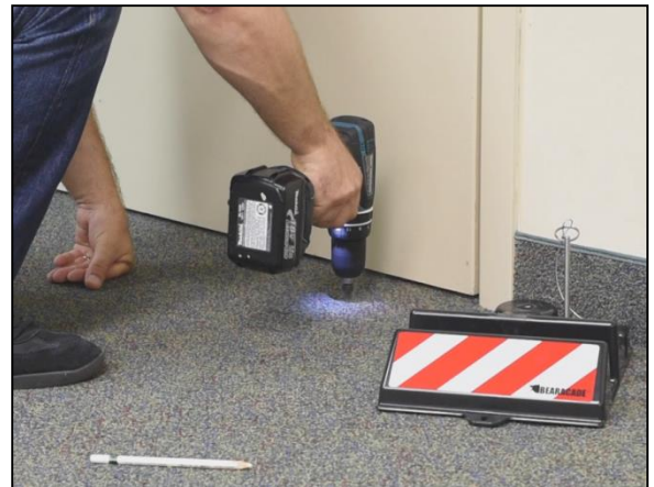
Fig. 2 – Hole Saw in Reverse on Carpet